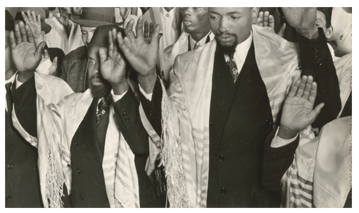
Members of Harlem's Commandment Keepers Congregation of the Living God, the Pillar and Ground of Truth, ca. 1940s.

were Black and that contemporary Black people [in America] are their descendants." Contemporary practitioners of one or another variety of this religion can be found in black congregations in Chicago, New York City, and Philadelphia. They generally identify themselves as Jews and Israelites, unlike the Black Hebrews of Dimona, Israel (originally from Chicago), who identify themselves as Israelites but not as Jews. This, of course, does not include the small but significant number of African Americans who have joined mainstream Jewish