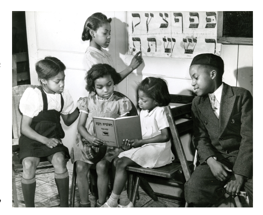
Children of Commandment Keepers study Hebrew, ca. 1940s.